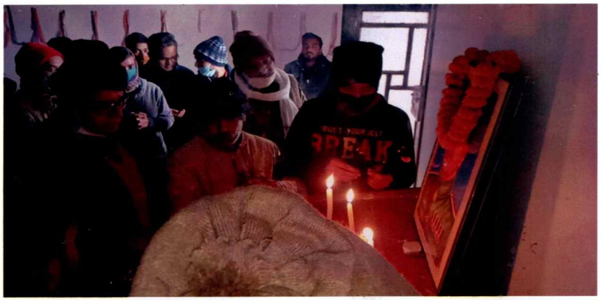
Session 2020-21 NETAJI Subhash Chandra Bose Jayanti